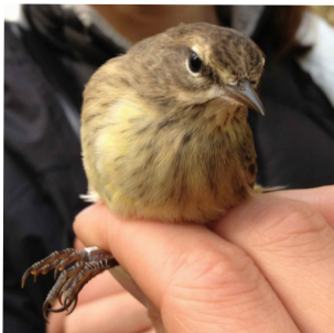
A Western Palm Warbler captured on the last net run of 2013. This year's Western Palm Warbler was the fifth ever banded in Alaska.

The 28 th year of operations at the Creamer's Field Migration Station was a success thanks to over 57 volunteers, three apprentices and two interns. Yellow-rumped Warblers (Myrtle subspecies) dominated the capture charts once again, with Orange-crowned Warblers close behind. Unusual captures included two Brown Creepers, a Northern Flicker, and a Lesser Yellowlegs. Adding to the year's excitement, we banded our first Spotted Sandpiper! However, the star of the season was a hatch-year Western Palm Warbler, only the fifth individual ever banded in Alaska! The total number of Palm Warblers banded in the western U.S. barely reaches the double digits, with the exception of a few locations in California where they total into the low 1000s. Typically thought of as an eastern warbler, recent range maps now acknowledge their presence in the far west, thanks in part to banding and citizen science efforts.